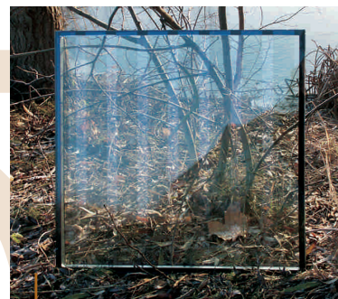
Sample pane ORNILUX®

According to tests undertaken up to now, ORNILUX® premium can be recommended for the limitation of bird impact to architects and developers who want to limit bird impact for building objects with large glass surfaces, but who also want to dispense of conventional, from humans discernable methods (i.e. bird of prey silhouettes or stripe patterns fixed on the surface and so discernable to the human eye) from the onset.